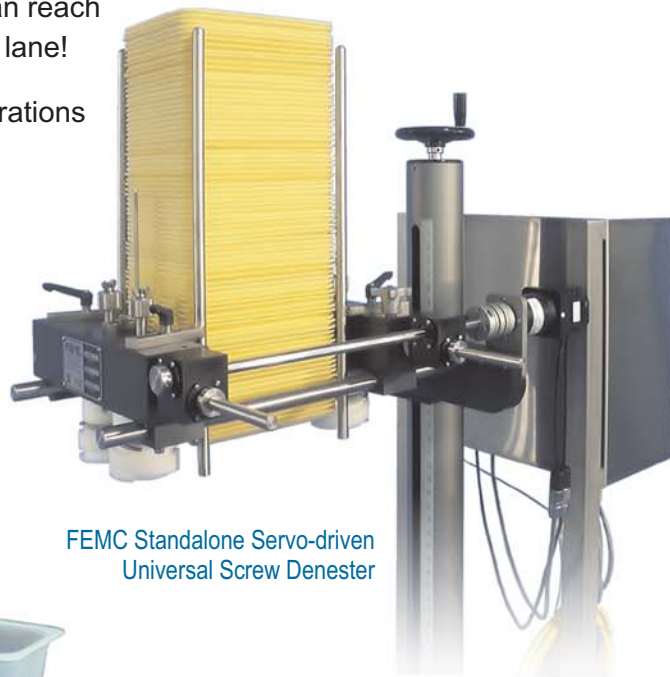
FEMC Standalone Servo-driven Universal Screw Denester

Available in standalone or line-mounted configurations for maximum flexibility and ease of integration.